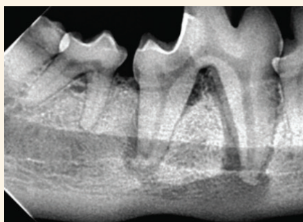
Periodontal & endodontic disease weakening jaw