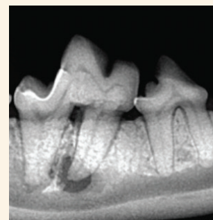
Abnormal tooth development with abscess