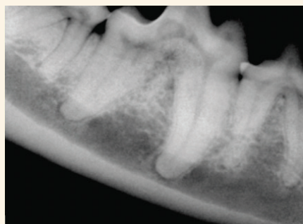
Tooth Resorption- dog